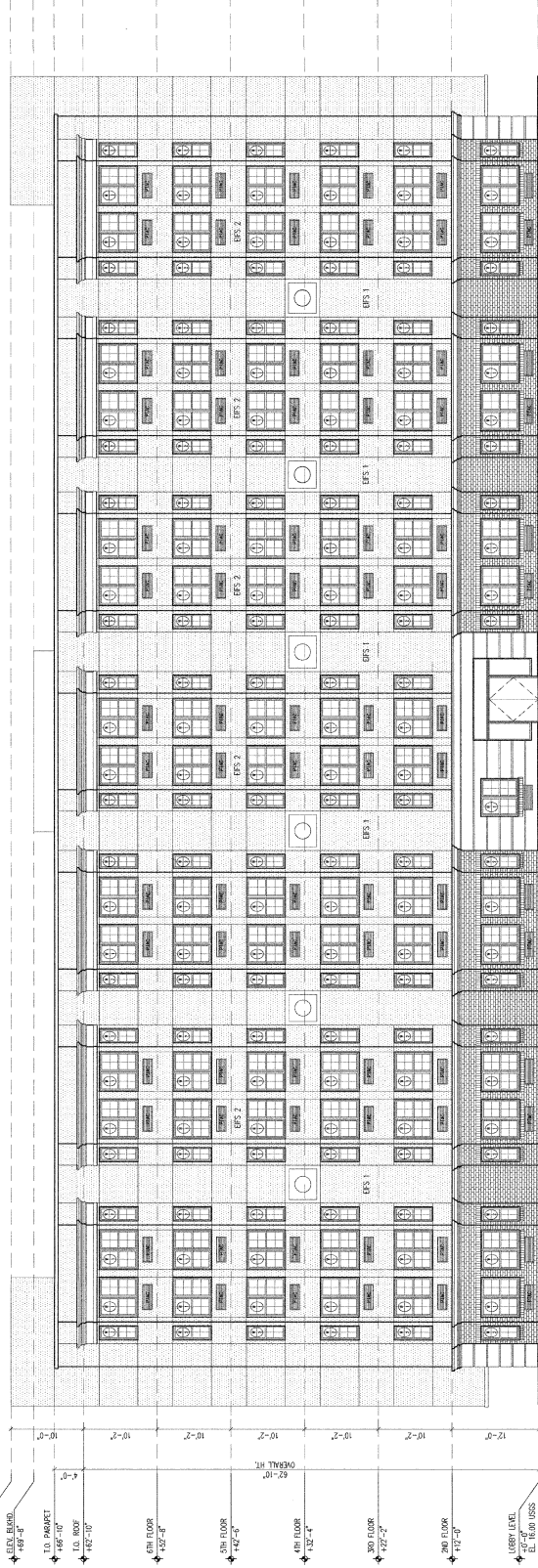
1 EAST ELEVATION SCALE: 1/8" = 1'-0"