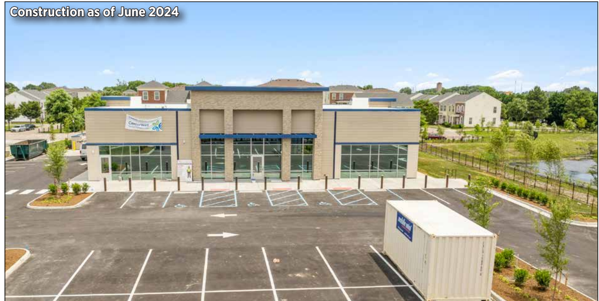
Construction as of June 2024