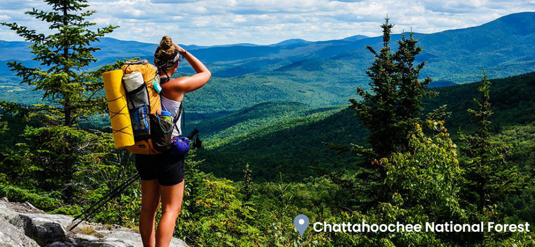
Chattahoochee National Forest