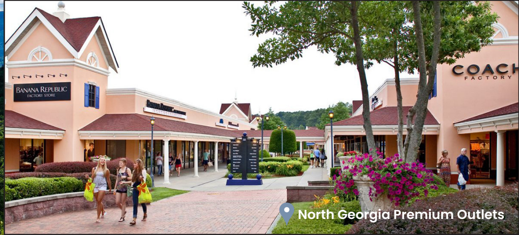
North Georgia Premium Outlets