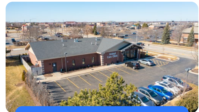
230 Stonegate Road, Algonquin, IL