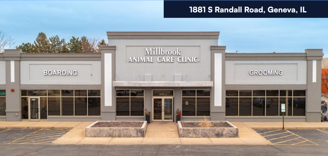
1881 S Randall Road, Geneva, IL