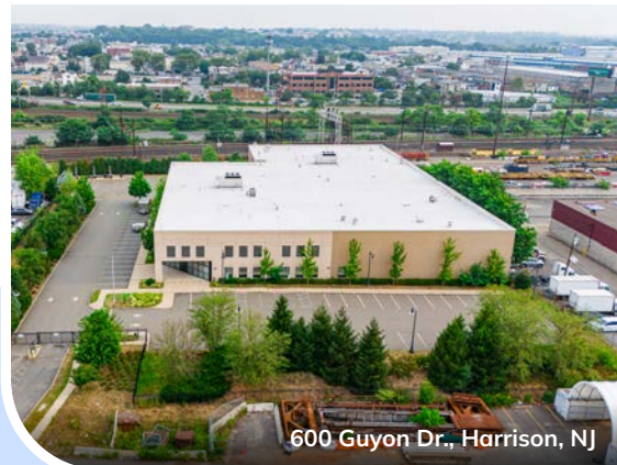
600 Guyon Dr., Harrison, NJ