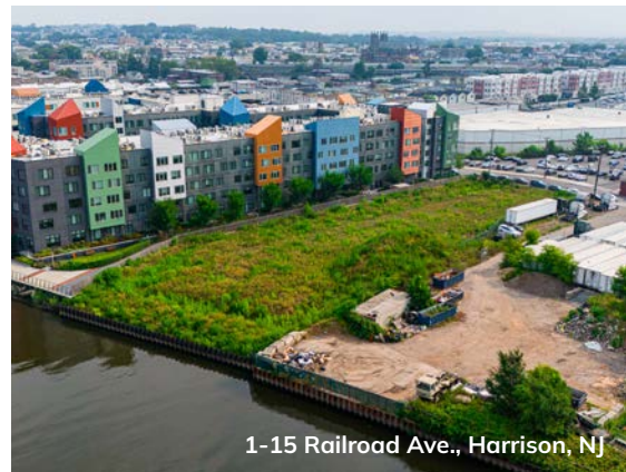
1-15 Railroad Ave., Harrison, NJ