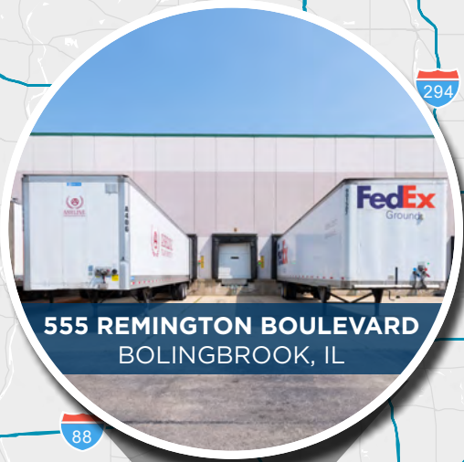
555 REMINGTON BOULEVARD BOLINGBROOK, IL